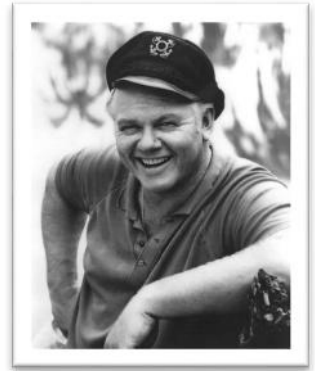
Allan Hale as Skipper

Hint: If you get stuck, ask for help from someone of a different generation. 😊